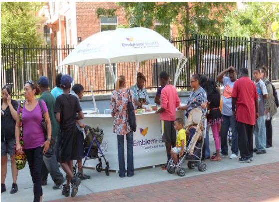
"Back to School Day" at Johnson Houses celebrated with the inauguration of Wi-Fi Technical Campus