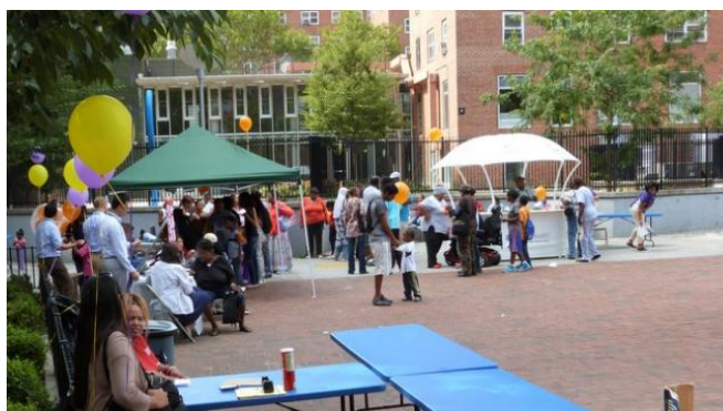
"Back to School Day" at Johnson Houses celebrated the inauguration of their Wireless Technical Campus