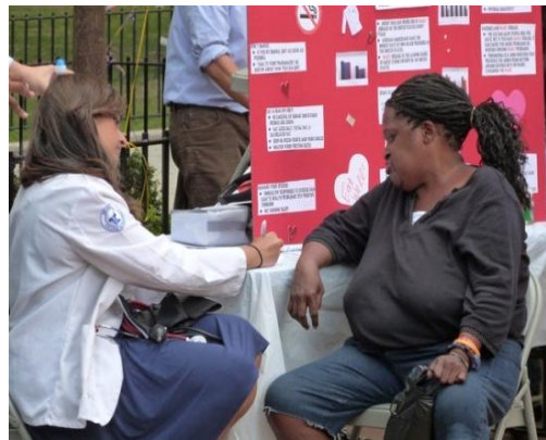
Healthcare Screening at Johnson Houses enhanced with free Wi-Fi provided over Wireless Technical Campus