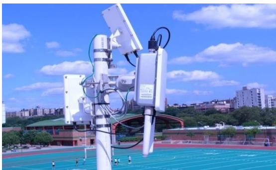
DDP Wi-Fi Radio at Riverbank State Park